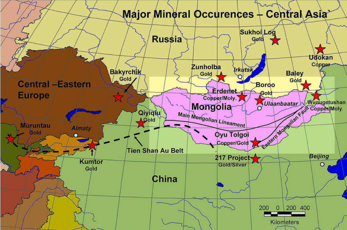
Created by the Company using public information including from, Mineral Resource Authority of Mongolia and University of Texas. Locations of mineral occurrences are approximate. Not to scale.